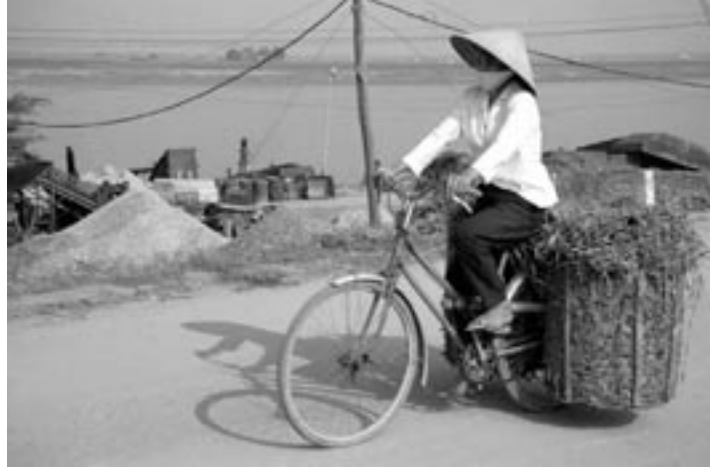
Transporting feed for grass carp

In another project the APSIM Manure and SoilP (phosphorus) modules have been modified to incorporate information allowing the management of soil fertility for low-input systems in the tropics. The SoilN (nitrogen) module has also been modified to specify added organic matter and its interactions. A project on the management of water