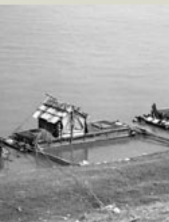
Grass carp cages on the Red River

Fungi that have the potential to act as bioherbicides against weeds have shown promise in a range of tests over several years. A bioherbicide for barnyard grass ( Echinochloa crusgalli ) was successful in shadehouse trials but was not successful in replicated field experiments in the Red River Delta. This may have been due to water management limitations or insufficient virulence. A second fungus for the weed red spangle top ( Lepochloa chinensis ) in southern Vietnam has been proven under field conditions, with no problems from its use alongside herbicides against other weeds. Simple methods for mass production of this fungus have been developed and a product suitable for farmer application is likely.