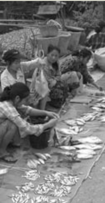
Lao fish market

Research to further the development of a low-chill temperate fruit industry in Laos, Thailand and Vietnam continues. Locally derived germplasm with disease resistance (including resistance to some major leaf diseases) and good quality characteristics has been identified for possible incorporation into breeding programs in Laos and Vietnam.