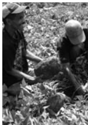
Harvesting sweet potato

Facilities at the Hera Experimental Station of the National University of East Timor's Agriculture Faculty have now been in operation for two years. The facilities, extensively damaged in the unrest after East Timor's independence vote, are vital for research and teaching agricultural science students. In addition course materials for many aspects of agriculture are now complete, designed to promote a problem-solving approach to learning that is vital to the on-going development of agriculture . ACIAR has extended the University Rehabilitation Project until December 2005 to ensure the good base created by the project is consolidated, including allowance for a revision of the agriculture curriculum.