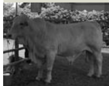
Breedplan producing results