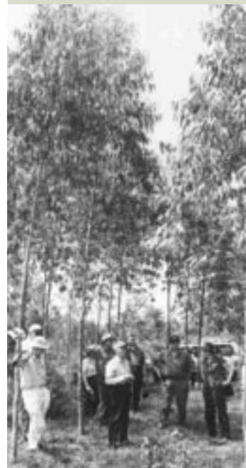
ACIAR Board of Management visiting an Acacia hybrid site