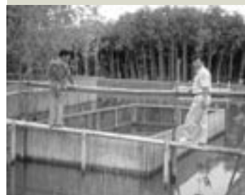
Mud-crab fattening pens