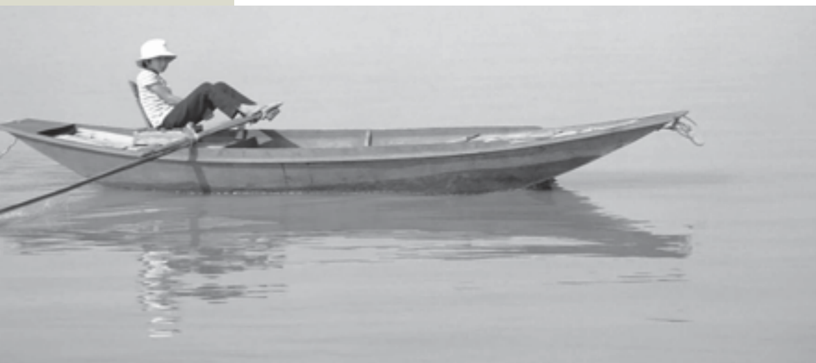
Transport on the Red River

Innovative approaches to the control of root, trunk and fruit diseases caused by Phytophthora have been developed for the durian industries in Vietnam and Thailand. These include trunk injection of phosphonate and the use of non-chemical treatments such as manures and mulches. More than 1000 farmers in Vietnam and 2000 in Thailand have been provided with information on these findings and their implementation.