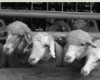
Sheep in Indonesia

Controls for the parasitic bee mites Varroa and Tropilaelaps have been developed using formic acid, and design of hives has changed to increase air flow. Honey is an important medicinal preventative and 'cure-all' in Indonesia, but the presence of mites reduces production significantly, meaning Indonesia must import honey.