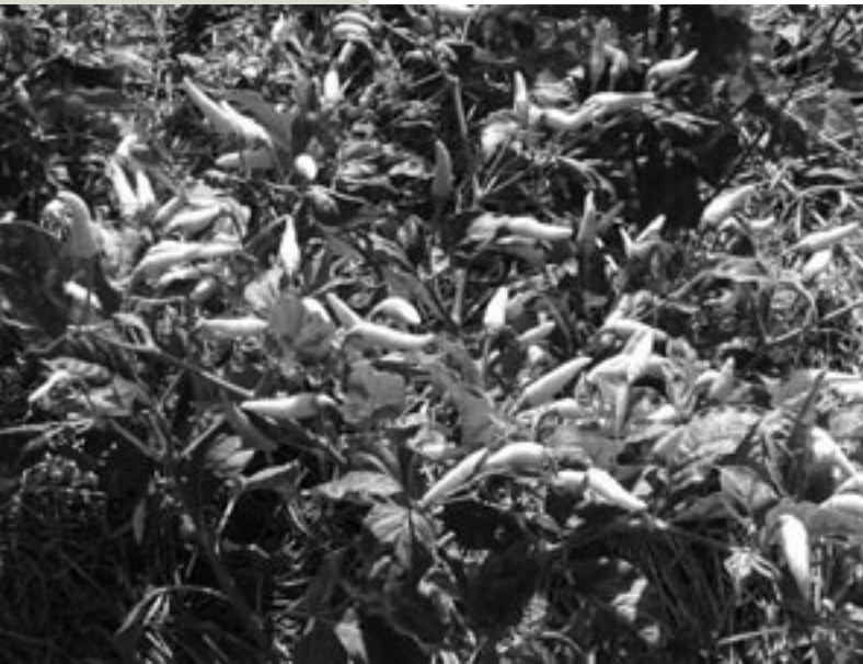
Chillies growing in vertisol soils

A collection of Indonesian and international cocoa tree clones has been established in Sulawesi as part of research into improving quality and disease resistance. Grafts of promising varieties have also been replicated , and all collections will be examined for improved quality and disease resistance. Researchers have demonstrated farmer management practices, including pruning, to improve the establishment productivity of clonal material grafted onto existing trees.