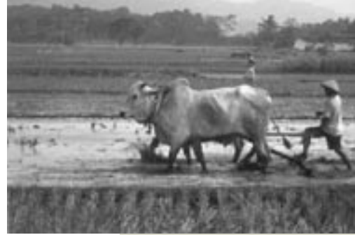
Preparing for rice crop

Improving the productivity of Bali cattle through improved management systems presently focuses on implementing research results. An economic model of a new system demonstrated better cash flows and gross margins from adopting changes. A competition to encourage risk-averse farmers to become participants was successful and also helped identify good bulls for use in future breeding. An extension package for Indonesian conditions is now being produced.