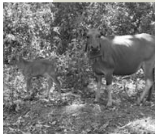
Bali cattle—capable of producing a 95 per cent weaning rate

Through adopting controlled seasonal mating, improvements in feed management and early weaning of calves, conception rates have increased to more than 90 per cent and calf mortality to below 10 per cent. New Leucaena varieties to help fatten cattle were also tested, with several promising varieties including Tarramba and the KX2 hybrid showing promise for many parts of Indonesia.