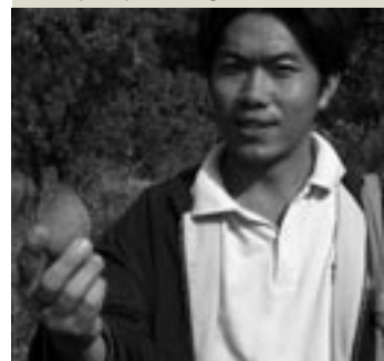
Benefit from low chill orchard