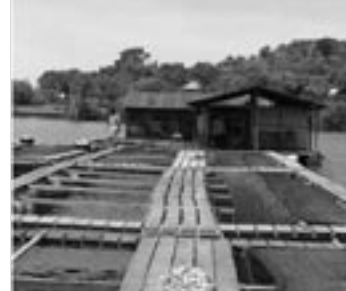
Floating barru cages

Aflatoxins which are a serious health risk to humans and some livestock can occur in peanuts as a result of contamination risks by the fungus Aspergillus flavus . Contamination risks during production are being assessed in Indonesian conditions using APSIM. A newly developed