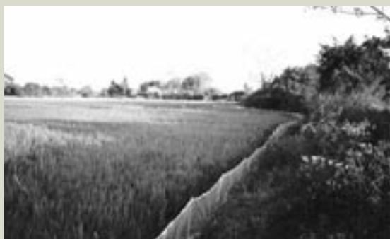
Rat trap barrier

The success of this, and other demonstration sites, has resulted in the Vietnamese Government using IRM as the basis of both national and provincial policies. The national policy directs farmers to practice IRM, with support at the provincial level, including budgetary allocations, to extend adoption of IRM and use of the Trap Barrier System.