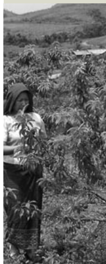
Low chill orchard

Trials of many rice varieties across a range of agro-ecological conditions demonstrated that yields could be substantially boosted by matching of varieties to conditions . High-yielding lines were identified. Screening varieties for drought tolerance has determined suitable varieties for further breeding. An improved management system for rice nurseries for irrigated rice in northern Laos was also developed.