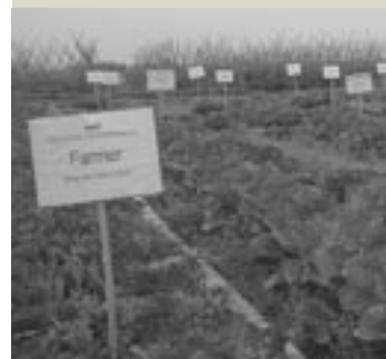
Project site for assessing impact of heavy metals on fertilisation and waste recycling in Vietnam