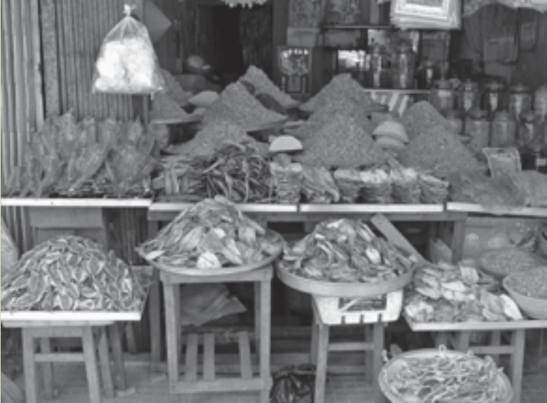
Dried fish at markets

distribution in publicly managed irrigation schemes revealed that improvements can be made to distribute water to farms more efficiently, but farmers must also make changes to the ways they use this water or these efficiencies will be lost.