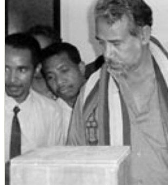
President Xanana Gusmao at the Hera Campus of East Timor Agricultural University