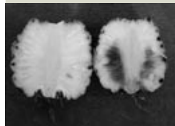
Pineapple with the postharvest defect blackheart