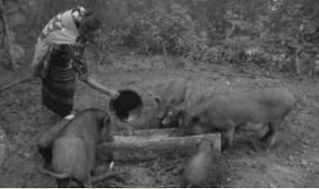
Hmong mother feeding pigs

Research to further the development of a low-chill temperate fruit industry in Laos, Thailand and Vietnam continues. Locally derived germplasm with disease resistance (including resistance to some major leaf diseases) and good quality characteristics has been identified for possible incorporation into breeding programs in Laos and Vietnam.