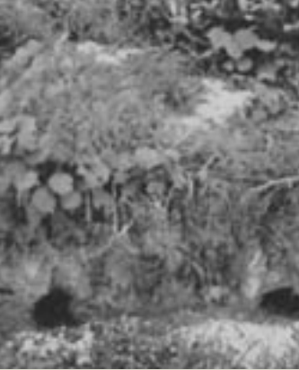
Rat burrows in rice crops