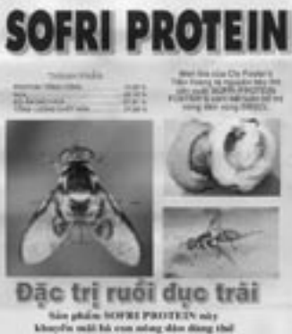
Protein bait against fruit fly

The low-chill fruit project, operating in Laos and Thailand as well as Vietnam, has identified rootstocks with disease resistance and improved quality characteristics, making them better adapted to Vietnamese conditions. Bait programs to help control the serious pest, fruit fly, have also been introduced. Fosters Brewery at Tien Giang, with support from BASF (formerly Aventis), AusAID and the ATSE Crawford Fund, opened a plant in April 2004 to manufacture a protein bait against fruit fly . The bait, based on ACIAR research, and comprising brewery waste mixed with tiny amounts of insecticide, is applied to trees to attract then kill the flies. Farmers involved in trials have recorded significant reductions in lost produce, with more than 1,600 farmers in 16 provinces now involved. Additionally, the spot spraying technology has facilitated a 250 to 500-fold decrease in the amount of insecticide required, which will have immense positive public health impacts.