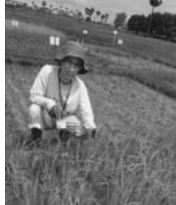
Rice research in Cambodia