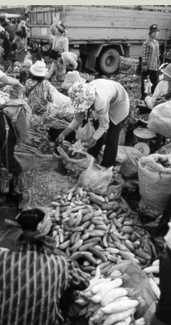
Dumkor vegetable markets

Crop diversification, from rice (where Cambodia has reached self-sufficiency) to other higher value crops has the potential to alleviate rural poverty, but is hampered by a lack of knowledge of how to grow non-rice crops, including choice of suitable land for planting. ACIAR is supporting research to help Cambodia establish viable cropping industries beyond rice. Three study sites representing a range of agro-ecological conditions have been chosen, with detailed soil profile descriptions recorded. Also trial crops sown to establish baseline yield data have demonstrated the need to acquire well suited cultivars. This information will be fed into other related projects.