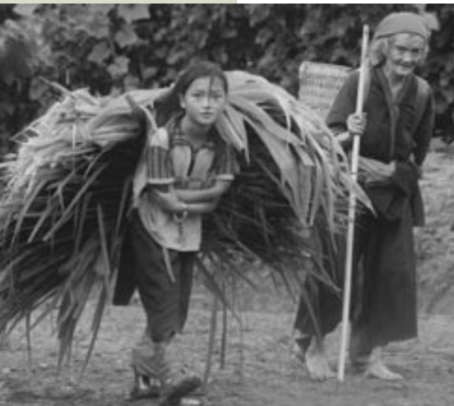
Foraging—carrying the future

The ability of the animal health services to manage foot and mouth disease and classical swine fever (CSF), already enhanced by past ACIAR-supported research that established diagnostic and investigative capabilities for both diseases , is being further strengthened. A new project is developing improved methodologies to deliver and evaluate village-based vaccination and control of CSF, together with the development of a rapid diagnostic test to support this initiative. Epidemiological information on both diseases is being collected to facilitate control strategies.