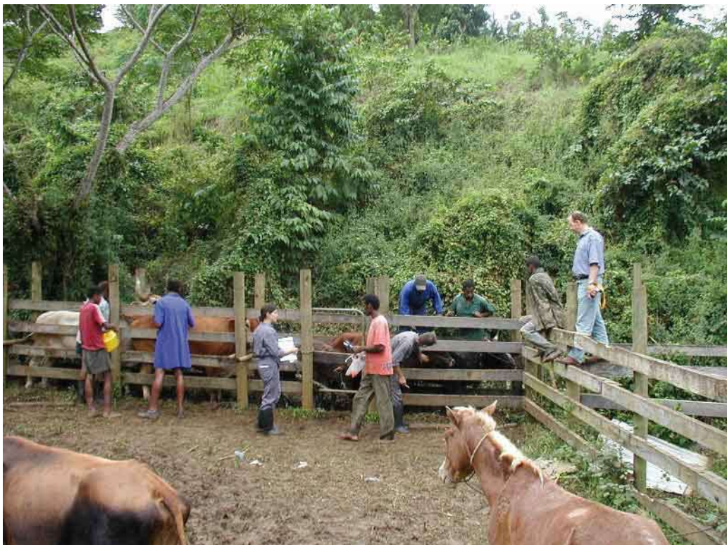
Veterinary checks for village livestock in Fiji

Pacific Extension Summit hosted by Tonga in November 2005 was the need to build the capacity of extension staff and associated institutions to undertake participatory research and extension (PARE). In response, ACIAR commissioned a small R&D activity to determine the particular situation for a range of Pacific islands and different institutions. By accounting for variations in context (e.g. social and cultural differences, previous institutional experiences, farmers' needs) and differences in institutional roles (e.g. of tertiary institutions, NGO networking agencies, government extension and research staff) ACIAR and partner institutions are now in a far better position to guide the development of tailored training and capacity-building programs.