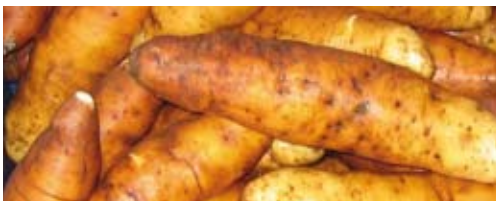
Yam production has increased in Vanuatu through better plant nutrition

The project to detect nutritional disorders of yams has concluded, having provided diagnostic information for nutritional problems of major yam species in the field