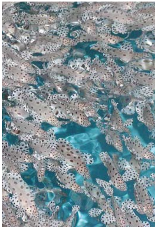
ACIAR-funded research has improved feed quality and breeding and larval-rearing techniques for groupers

Another project is identifying and promoting strategies for Pacific island nations to maximise the economic benefits from their migratory tuna stocks . Shoals of tuna migrate through the exclusive economic zones of island nations in the Western and Central Pacific Ocean. This migratory characteristic means that no nation has control over the tuna stocks. The member nations of the Forum Fisheries Agency have long adopted a mutually beneficial coordinated regional management approach to regulate the catches of their own domestic fleets and those of distant water fishing nations. The projects outputs—economic analyses, bioeconomic modelling and policy development—are all potentially valuable aids to establishing the economic negotiating positions of Pacific island nations with rights to migratory tuna stocks, as well as the positions of the distant water fleet nations (DWFNs) such as Japan, USA, South Korea, Taiwan and China, who are interested in paying for access to the stocks.