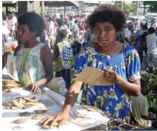
Fish sellers at Lae market, Papua New Guinea

ACIAR is committed to assist the sustainability of fisheries around PNG. Active projects include a survey of the biology and status of the prawn stocks and trawl fishery in the Gulf of Papua, and an assessment of the impact of the PNG purse seine fishery on tuna stocks. The PNG tuna fishery is the largest in the Pacific Islands region, and is based on total allowable catches allocated by species