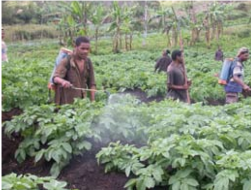
Fungicide application is helping control potato late blight in Papua New Guinea

be too much for 'subsistence' farmers, who once relied on potatoes as a valuable cash crop. This situation will not change until late-blight-resistant varieties are available. An ACIAR project aims to provide a consistent and assured supply of seed potatoes of current and new varieties for the market place. It has supported tests of several potato varieties developed by the International Potato Centre in Peru (CIP) that have proved to be very resistant to the blight. A tissue culture laboratory at Aiyura is being prepared to produce high numbers of quality potato plantlets as a forerunner of blight-resistant Certified Seed Potatoes.