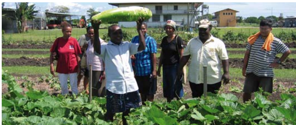
Evaluation of superior vegetable varieties for Solomon Islander smallholders

The horticulture industry has potential for many Pacific communities. In Tonga the leading horticultural export is squash, earning $10.8 million in 2002. Squash is quick and easy to grow with a lucrative market in exports to Japan. A project is in progress to improve field-based crop protection and market quality of squash by addressing pests and diseases such as powdery mildew, silver leaf whitefly and virus diseases—also to better manage weeds. Trials in 2005 and 2006 in Tonga and Australia showed that using environmentally friendly chemicals was just as effective in controlling powdery mildew as using traditional fungicides. The researchers screened weed species and other cucurbit crops in the search for alternative hosts for viruses and, using ELISA tests, they identified two weeds that carried two virus diseases affecting squash. This led to the