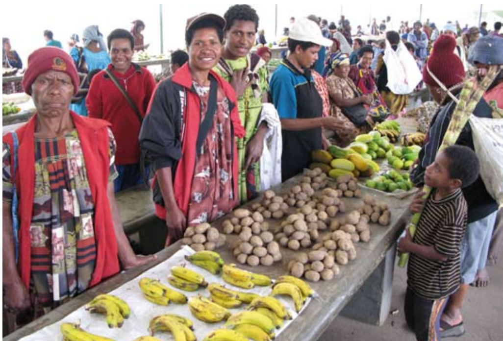
Smallholder vegetable farmers have increased production through improved pest and disease management

There has been a strong focus on quality improvement and marketing enhancement for peanuts . Large-scale multiplication of selected varieties took place at Ramu Sugar to facilitate seed supply for on-farm trials. Eighteen trials in the Eastern Highlands, Upper and Lower Markham Valley, undertaken in collaboration with local farmer groups, evaluated new varieties and