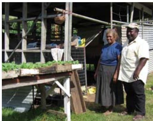
Peri-urban production of Chinese cabbage

In Solomon Islands, a project is developing improved systems of village-based poultry production by identifying rations for village-based layer and meat birds based on locally available feedstuffs.