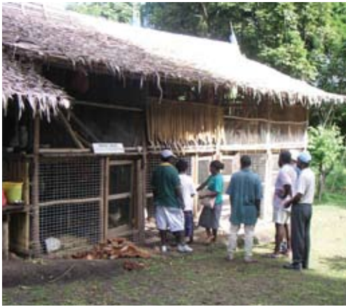
A poultry farm training site, Solomon Islands

At the SI College of Higher Education (SICHE) maize, sorghum, mung beans and pigeon peas were planted on campus to demonstrate the potential for villagers to grow these as feeds for poultry. The crops were harvested, dried and stored for nutrition trials. A 16-pen poultry research facility was constructed and commissioned. Test diets comprising different mixes of components such as sorghum, pigeon pea and locally available fresh coconut and paw paw leaves and fruit were evaluated. The project team is interacting with farmers and farmer groups to trial the diets and gather feedback about the value of these rations. A survey of 90 village poultry farmers in 31 villages from Guadalcanal, Western Province, Malaita and Central Province gave cause for optimism. The team found that most farmers considered chickens were easy to care for and a good enterprise for providing cash income and extra food for the family.