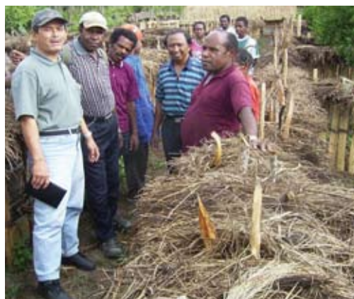
Project workers and villagers inspect new lalekens (small paddocks) that enhance traditional village-based food production systems

PNG faces some formidable challenges to its agricultural development. It is a net food importer with high population growth rates. Village-based agriculture supports 70–80% of the population, and domestic trading of fresh produce is a very important source of cash income. By far the most important crop in PNG is sweet potato. Other root crops are also important but well below sweet potato. The main cash crops in order of export value are oil palm, coffee, cocoa and coconuts.