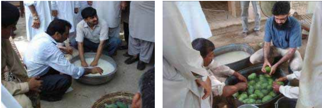
Demonstration of fruit desapping

harvested along with stem are de-stemmed and dipped in 0.5% lime solution for about two minutes followed by washing in clean water and air drying. The alternate methods involve de-stemming and keeping the fruit inverted for at least 30 minutes and even harvesting the fruit with about one inch stem followed by no treatment.