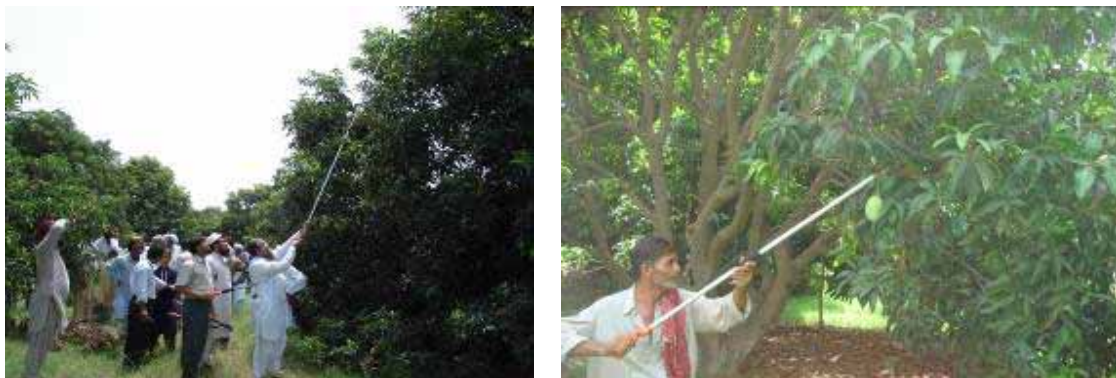
Demonstration of fruit harvesting

The participants were told to harvest the fruit along with about four to six inches stem to avoid the flow out of sap, which if comes out at any stage before proper desapping can deteriorate the appearance of itself as well as its surrounding fruits. The harvest along with stem can be done by specialized harvesting poles (manufactured by PHDEB) as well as secateurs. They were also told that we can manage the temperature, at least for consignments for high end markets, by managing harvest early in the morning followed by desapping and placing in shade during the day time and transportation in the evening.