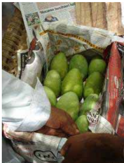
Demonstration of fruit Packing

Fruit packing is another important area, which was addressed in an independent activity of ASLP Mango Supply Chain Management Project, has a vital role in fruit presentation at consumer's end. The activity audiences were trained in fruit packing in reference to the longevity of its shelf life and the quality and manufacturing issues of packing material were also discussed.