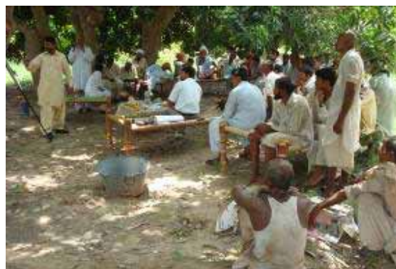
CABI & F&V Project team briefing the audience about Fruit Fly Management