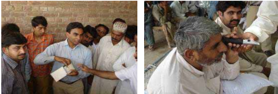
Fruit maturity determination

The workshops audiences were given training on fruit maturity determination by the use of maturity guide, refractometer, and rough estimate by visual observation of fullness of cheeks and skin appearance. The fruit, if not mature enough or becomes over mature, will have shorter shelf life compared with fruit harvested at proper level of maturity.