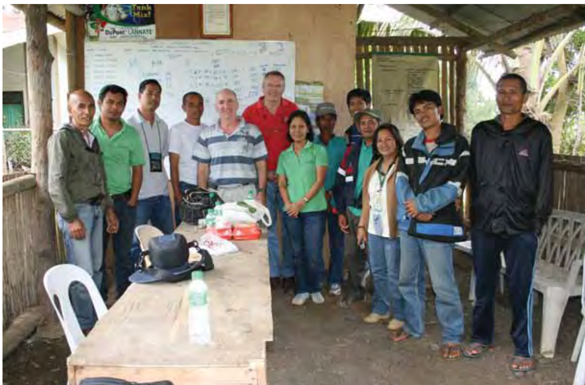
A meeting of the Landcare Foundation of the Philippines with farmers in Lantapan, Bukidnon