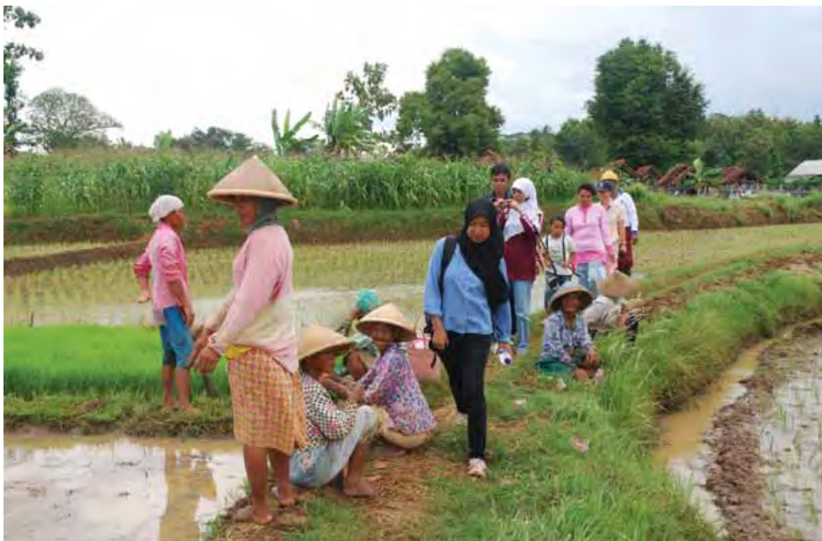
Farmers in South Sulawesi working with an ACIAR project to locally adapt simple rice management practices