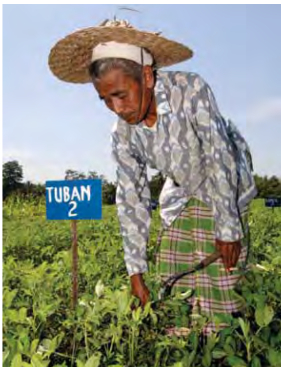
A farmer in Lombok trialling new varieties and management systems to make peanut production a less risky farm activity

lack of access to a range of simple, effective feeding and management practices, and to inefficient supply-chain linkages with urban markets.