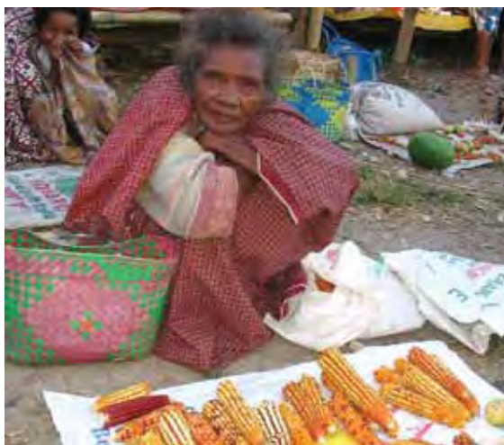
A woman selling maize, which remains the staple food of the countryside in East Timor

Priorities for collaboration are determined through discussions, interactions and visits between scientists and research managers from East Timor, ACIAR and Australian research institutions. ACIAR will address priorities within the framework of cropping, livestock, fisheries and forestry, where partner capacity will be crucial in determining collaboration. While the program will remain small, further assistance may be considered in special areas of need, particularly in addressing food security, resource protection and capacity development.