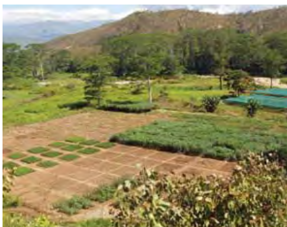
Testing and demonstration of improved varieties of staple crops at Quinta Portugal near Aileu, East Timor

Agriculture provides livelihoods for more than 80% of the population. The similarities between the environments of East Timor and northern Australia give Australia a comparative advantage in applying research, development and extension skills. ACIAR began collaboration with East Timorese institutions in 2000. Current projects aim to help achieve food security,