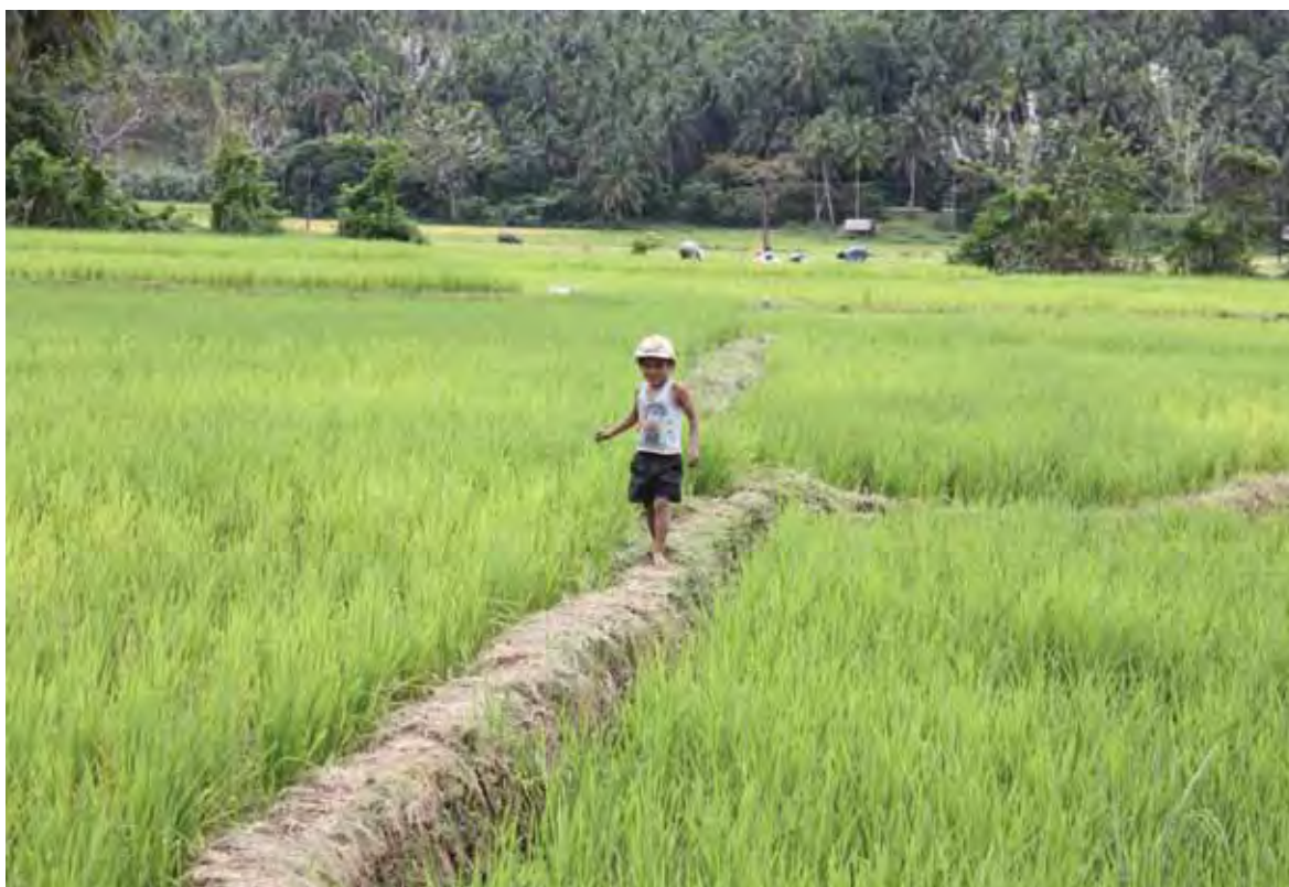
A child in the rice fields of Calbayog, Samar