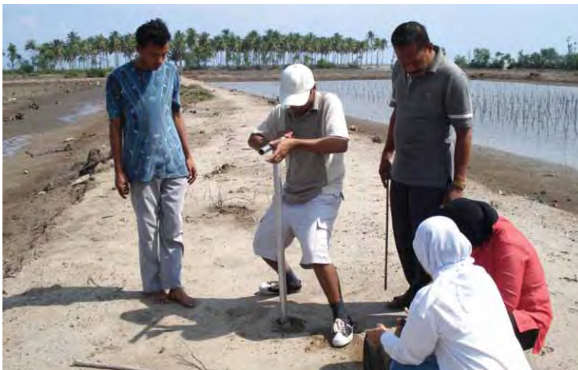
Acehnese project staff taking soil samples as part of field training in pond-survey techniques