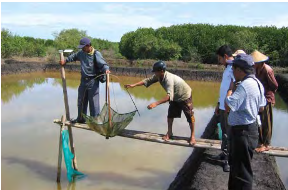
Sampling shrimp from formerly acidic experimental ponds at Maranak, South Sulawesi

Indonesia is in a strategic position for Australia with respect to trans-boundary plant and animal diseases, given its close proximity. Eastern Indonesia is a high priority for ACIAR in this and other respects, and our program includes activities in East and West Nusa Tenggara, South Sulawesi and South-East Sulawesi provinces under both SADI and the main ACIAR program. In addition, there is an increasing emphasis on Papua and West Papua, and several ACIAR–AusAID co-funded project activities were initiated in 2009–10. Engagement in Aceh has evolved to provide support for increasing farmer incomes from agriculture and aquaculture over the medium term. ACIAR will encourage linkages between the research agencies in agriculture, forestry and fisheries and the policy/implementation directorate-generals in the same ministries, where appropriate, as well as with other ministries such as the Ministry of Trade. ACIAR will support linkages between research institutions in Java and Sumatra and the more adaptive research agencies and planning authorities in eastern Indonesian. In addition, there will be a greater involvement of private sector and other non-government partners in the program.