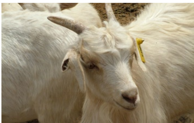
Research and extension has helped reduce the mortality rate of kids from 67% to less than 3%.

Chemical de-worming is simple and effective but not widely used, possibly because it is expensive. Also the increasing problem of parasites developing drug-resistance to some chemical groups limits their effectiveness.