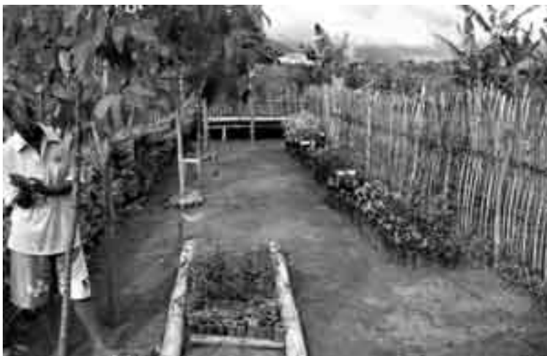
Tree nursery for Philippines Landcare project