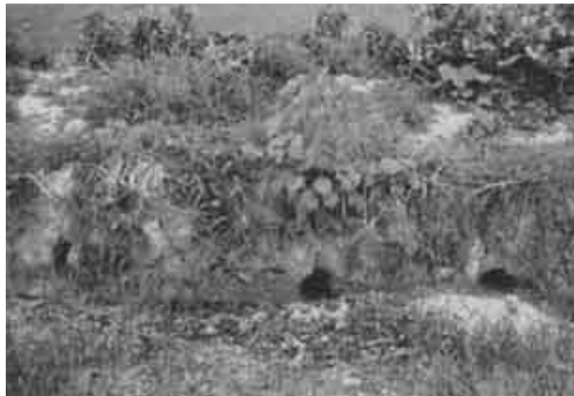
Rat burrows in rice crops

ACIAR’s Burma program has only recently begun, with the commencement of projects to extend capabilities in delivering Newcastle disease vaccines and for rodent control through use of the successful trap barrier system, mid-way through the financial year. Early reports indicate good progress.