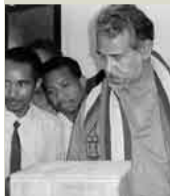
President of East Timor Xanana Gusmao inspected the newly opened facilities at the Hera Campus of East Timor Agricultural University