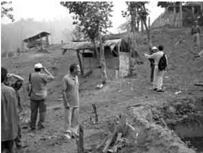
Site visit to Laotian smallholder livestock producers (chickens, goats and cattle)