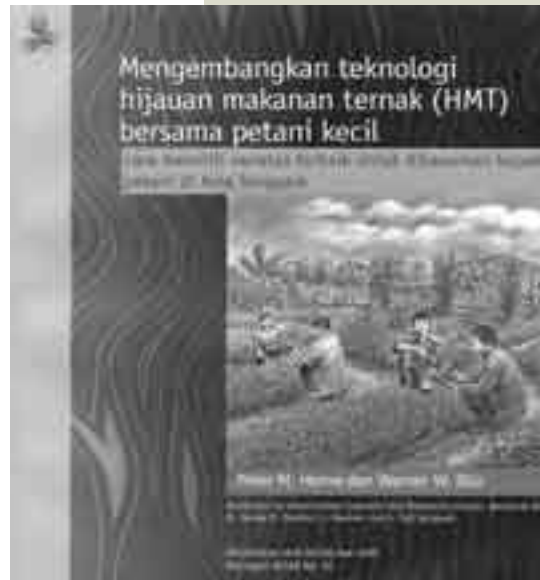
We publish in Indonesian

Limiting the emission of greenhouse gases , particularly carbon dioxide, with the potential to cause climate change, is the focus of another ACIAR-funded project. Results included demonstrating the ability of land-use change and forestry projects to offset permanent emissions of carbon dioxide from the energy sector, based on accounting approaches for carbon sequestration. Approaches have been proposed, with strongly divergent implications for both landholders and investors. These implications are expected to influence the design of projects and policies to capture carbon sequestration benefits .