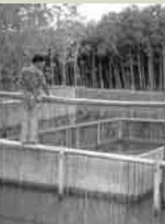
Mud crab fattening pens

three-month mating period) and weaning of calves at six months were adopted. This resulted in cows in better condition that were less costly to feed, and calves growing better when fed appropriately. The controlled seasonal mating has been a further boon, with over 90 per cent of eligible cows producing a calf, compared with about 60 per cent under traditional management. A new project is being developed to scale up this initiative to other villages where the strategies can be applied. Discussions with farmers at Kampung on Sumbawa (one of eastern Indonesia's transmigration areas) identified that a better rice variety for their upland conditions was the highest priority. A dozen accessions were assembled and established for the 2002 wet season and farmers made their selection. Seed was bulked up during the dry season, with the new variety achieving record yields, about 50 per cent higher than from the existing varieties, during the 2003 wet season.