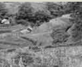
Philippines model farm project

reasons for traders not supporting farmers by providing the prices expected for vegetables. Most traders are either unwilling or unable to provide market information or to help the farmer grow better crops by providing technical information or training programs. The University of the Philippines in Mindanao now offers a course in supply chain management. The University is also developing strong links with the regional node of the Department of Agriculture, a USAID-funded project and players along the vegetable supply chain including supermarkets. An overview of production and marketing systems and government policy pertaining to the Philippine poultry industry has been completed.