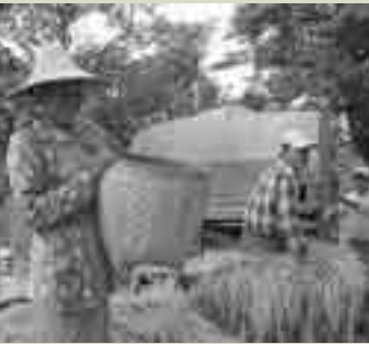
Workers in Burma