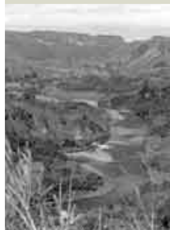
Philippines landcare projects

Marketing and agribusiness studies are an important research emphasis. A survey of 209 farm vegetable-producing households in southern Mindanao, conducted during 2002, revealed a range of