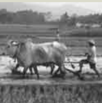
Preparations for rice crop

Project work in agricultural economics has advanced the development of a sustainable microfinance system for agricultural producers . The study showed that successful schemes needed to serve the wider community, not just farmers, and have low transaction costs. Dissemination of the research has included interactions with provincial government committees on the poverty alleviation program, as well as the Ministry of Finance to look at the model being applied nationally. The issue of whether farmers participating in contract farming were better off than those that did not was addressed through project work. The results showed lower transaction costs were a key aspect of the success of the contract under study, which provided a low-cost way for farmers to access the seed corn market. This allowed diversification in production, reducing risk, providing guaranteed prices and enhancing profitability. The involvement of grower groups also provided the contractor with benefits in terms of the costs of drafting, negotiating and enforcing the contracts.