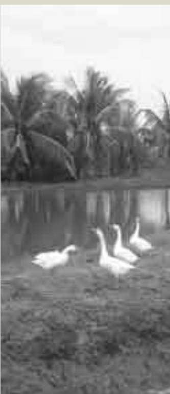
Shrimp-rice farming systems research site in Soc Trang province

A strategy for including environmental benefits and costs of alternative water allocation scenarios in the Mekong Delta region within an economic-hydrological model is being developed in conjunction with the International Food Policy Research Institute (IFPRI). In a separate project the application of irrigation main system operation modelling frameworks at three different sites improved operational rules for physically controlling water. This overcame existing system-specific constraints to achieve a more efficient use of water. At one site at Cu Chi a reduction in annual water use of about 98 MCM is possible, allowing excess supply to be diverted to Ho Chi Minh City with minimal impact on the supply security of the system. Subsequent field trials at other sites improved equitable supply to farmers.