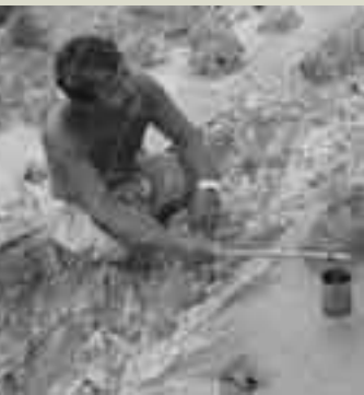
A member of the World Vision supported vegetable grower cooperatives demonstrates his simple tool for cutting holes in which to plant cucumber seedlings