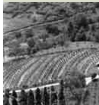
Temperate fruit orchards in Thailand

A study of the Effects of globalisation and economic development on the Asian livestock sector confirmed the growing demand for livestock products in the five Asian case study countries (Thailand, Indonesia, Philippines, Vietnam and China). The model took into account a range of factors and identified that seafood, pork and poultry are the major livestock products consumed. Demand for these products, and for the lesser consumed beef, are anticipated to grow at 2.5–7 per cent per annum to 2020, depending on country and commodity. The study determined that improvements are needed on the supply side for these countries to remain competitive as protection diminishes with trade reform. The relationships between grain prices and smallholder and commercial sectoral advantages were also determined.