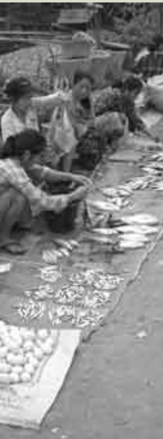
Lao fish market