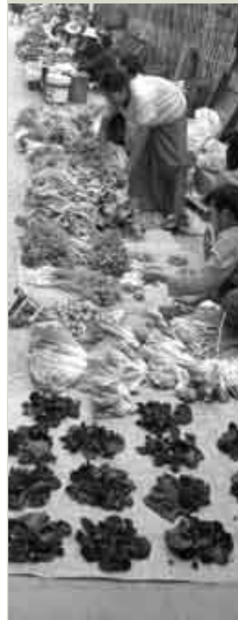
Lao vegetable market

A project aimed at building capacity in the identification and management of animal diseases has established a field investigation network and operational virology laboratory. Tests to identify the presence of foot and mouth disease in cattle and classical swine fever in pigs have been developed and are now in use. Molecular studies of the epidemiology of the two diseases are now underway. These tests, backed by the enhanced skills and infrastructure, have significantly expanded the diagnostic capabilities of Lao authorities involved in monitoring disease outbreaks.