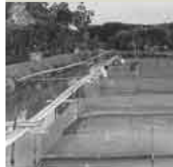
A typical aquaculture set-up, common in coastal areas of Indonesia

Nutrition research has identified many of the nutritional requirements of several species of high-value grouper , which has allowed the development of artificial (pellet) diets. Trials are now being undertaken with commercial feed companies to develop commercial grouper feeds. ACIAR also supported a request of the Indonesian Government to address a serious carp disease epidemic (Koi carp herpes) in Java. The outbreak represented a grave threat to common carp, a major food fish and source of cheap protein. ACIAR assisted Indonesian scientists to undertake a detailed disease survey, and provide training on the suite of epidemiological tools developed under a past project. This study will input directly into the development of a national control and management plan for the virus.