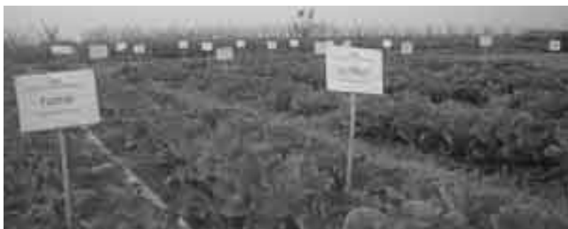
Project site for assessing impact of heavy metals on fertilisation and waste recycling in Vietnam

Assessment of the benefits and risks associated with use of composted green wastes, biosolids (sewage sludge) and organic wastes has begun to quantify and highlight benefits and potential food quality issues relating to heavy metals . Skills development for assessing nutritional and detrimental effects has emphasised quality control. Cost-effective contaminant monitoring of produce has been enhanced with the development of prototype residue test kits for aflatoxin B1, cyclodienes and DDT. Preliminary evaluation of the test kits commenced in laboratories and feed mills. Using skills acquired through ACIAR support, the Vietnamese team is developing test kits for other contaminant risks such as Salmonella in seafood and processed meats and shrimp virus diseases. Grain storage pest losses are being reduced as a result of surveys, demonstration trials and training which have addressed the different requirements for farmer storage, central grain stores and the animal feed industry. The commercial sector extensively uses the grain fumigant phosphine; however, work is examining methods that farmers can also safely apply.