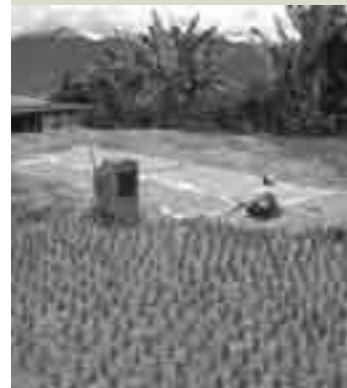
Drying rice crops