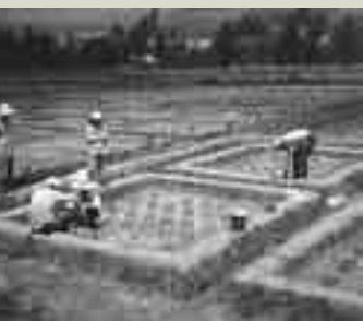
Experimental site at Ubon Research Centre