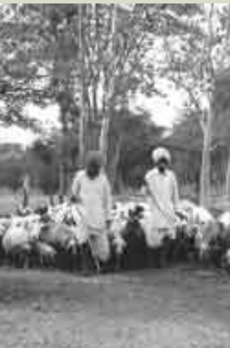
Garole sheep, Maharashtra, India