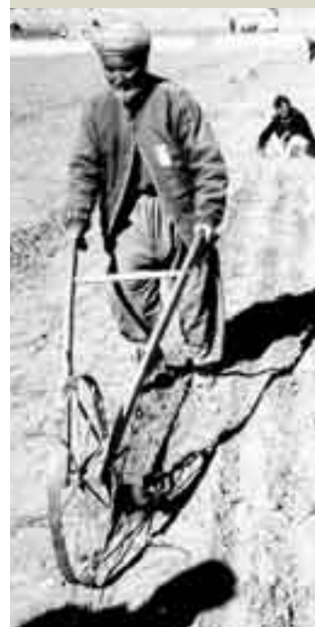
Afghani establishing crops