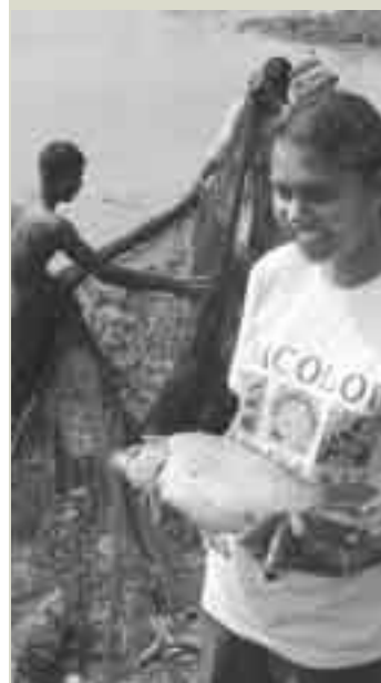
First harvest from a project-supported small reservoir in north-central Sri Lanka

ACIAR is supporting research on enhancement of disease resistance and loss reduction in mangoes and bananas in Sri Lanka. In Sri Lanka, preliminary investigations of disease resistance in banana fruit have documented cultivar differences in phytoalexin production and tissue acidity. Studies on mango found the same preformed defence compound in nine local cultivars. In Australia, research has commenced on treatments which enhance the natural defence mechanisms in mangoes.