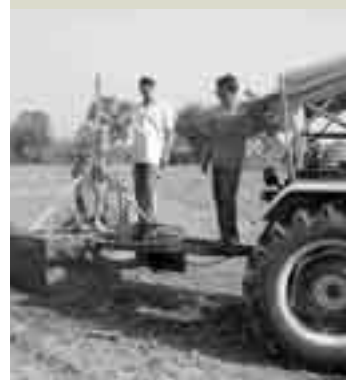
Indian tillage machine

Livestock productivity improvements including through better feeds are very important in Indian agriculture, particularly for poor smallholder farmers. Dairying is the sole source of income for about 11 million