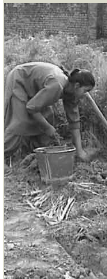
Farming for vegetables in the Punjab