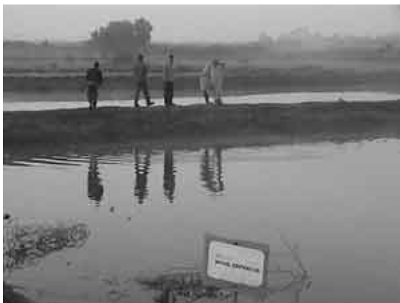
Inland saline fishpond in Haryana, India