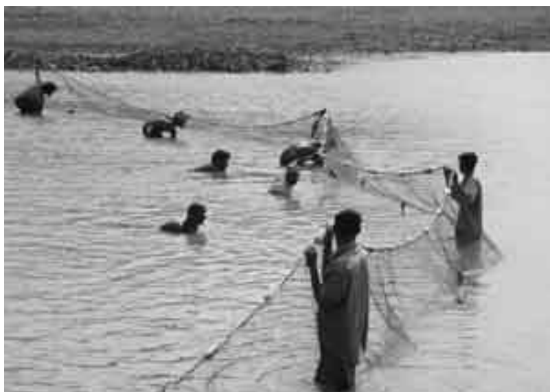
Sri Lanka pond harvest