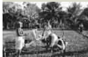
Farming in Goa

Research into reducing the harmful environmental impacts of wool scouring effluent has resulted in compulsory procedures being put in place for wool mills involved in scouring. The procedures focus on identifying environmental impacts and utilise audits developed during the project. As in China, links between profitable operating procedures and reductions in effluent discharge were identified.