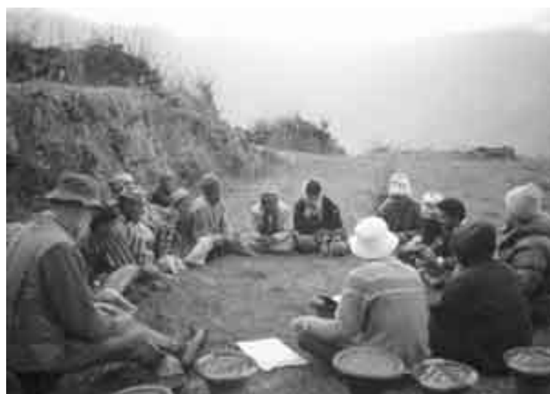
Project leaders meeting in Nepal