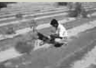
Measuring soil salinity