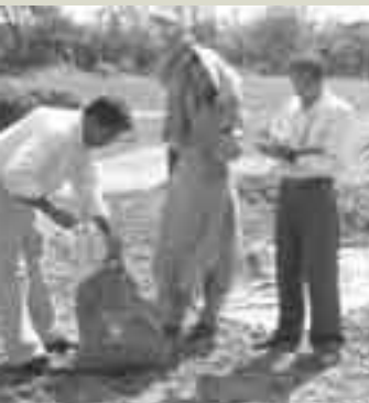
Bangladeshi members of the ACIAR scientific team at work in the field