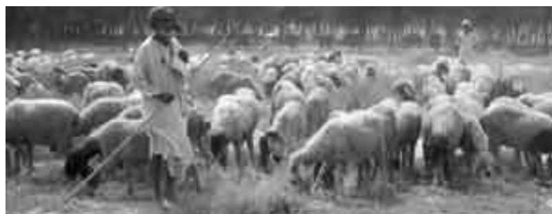
Grazing on saltbush