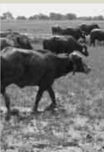
Buffalo grazing on kellar grass - irrigated saline soil

Growing maize and wheat on permanent beds has improved yields despite the reduced use of water. During the project's four years of experimentation summer maize yields on beds yielded 54 per cent higher than on the flat while using 33 per cent less irrigation water. For wheat grown on raised beds yields over a three-year period were only three per cent above those on the flat, but 37 per cent less water was used. Nearby farmers who have adopted raised beds are achieving similar efficiency gains with the new system. Research to better understand the Gemini virus diseases of cotton and tomato through molecular characterisation of these viruses is underway. The studies are leading to a better understanding of the nature of crop plant resistance, which will help in the development of effective management techniques.