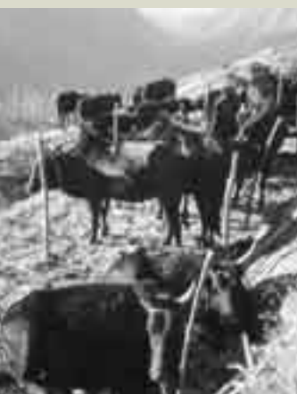
Livestock keeping in Nepal

Useful resistance to the wilt-root disease syndrome has been defined in nine lentil selections, representing a significant improvement in the resistance level of current Nepali and Australian cultivars. A mapping exercise has defined the extensive range of acid soils where a combination of rhizobial strain with best adapted genotypes can boost lentil production . Research into seed priming technology has resulted in the Nepal Agricultural Research Council framing a recommendation for its use by growers, following yield increases in some trials of up to 43 per cent.