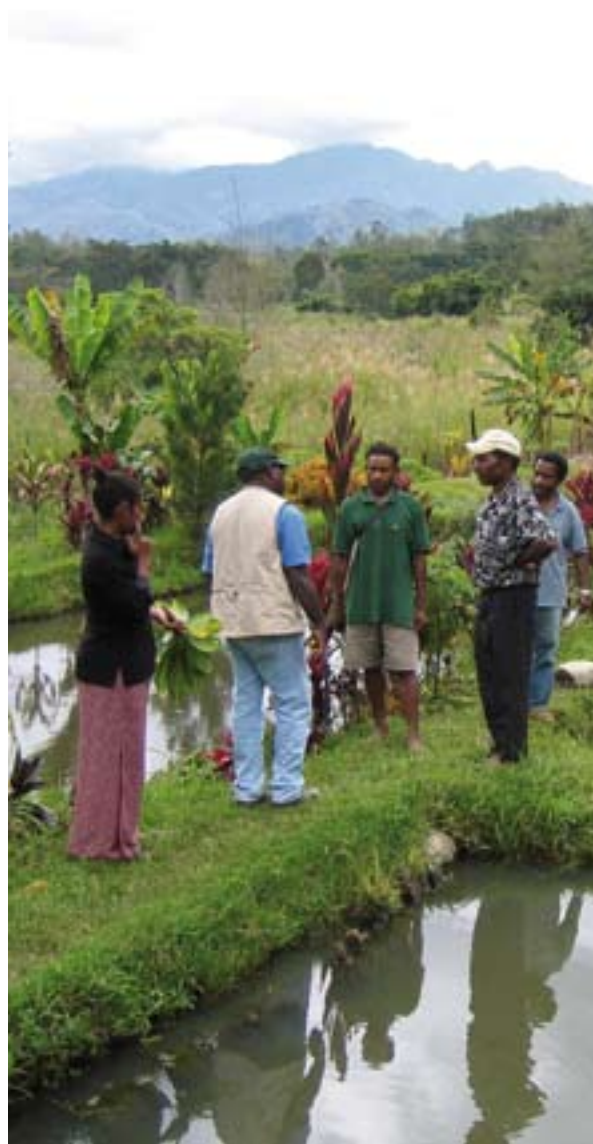
Improving fingerling supply and fish nutrition for smallholder farms involved in inland aquaculture in PNG