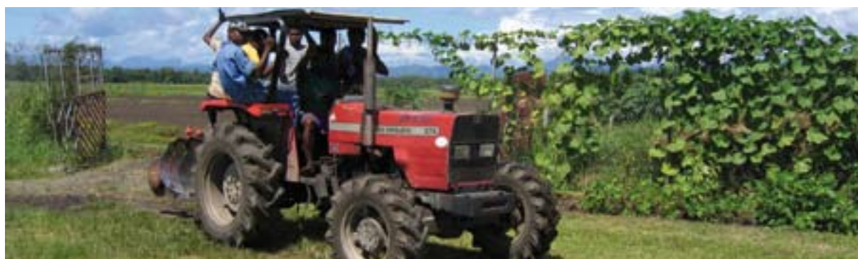
Vegetable trials at the Don Bosco rural training centre Honiara Plains, Solomon Islands

a Purchasing power parity (see Appendix 3, Selected world development indicators)