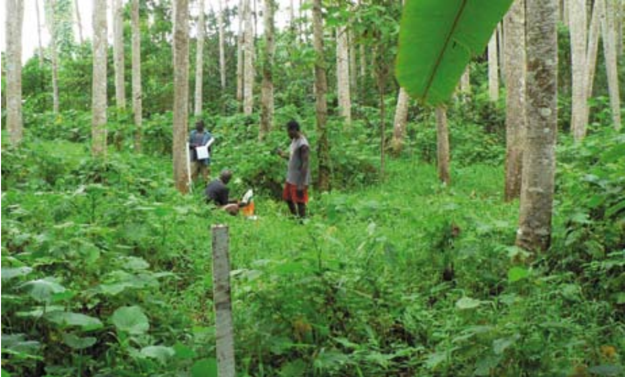
Silviculture management trials in Vanuatu