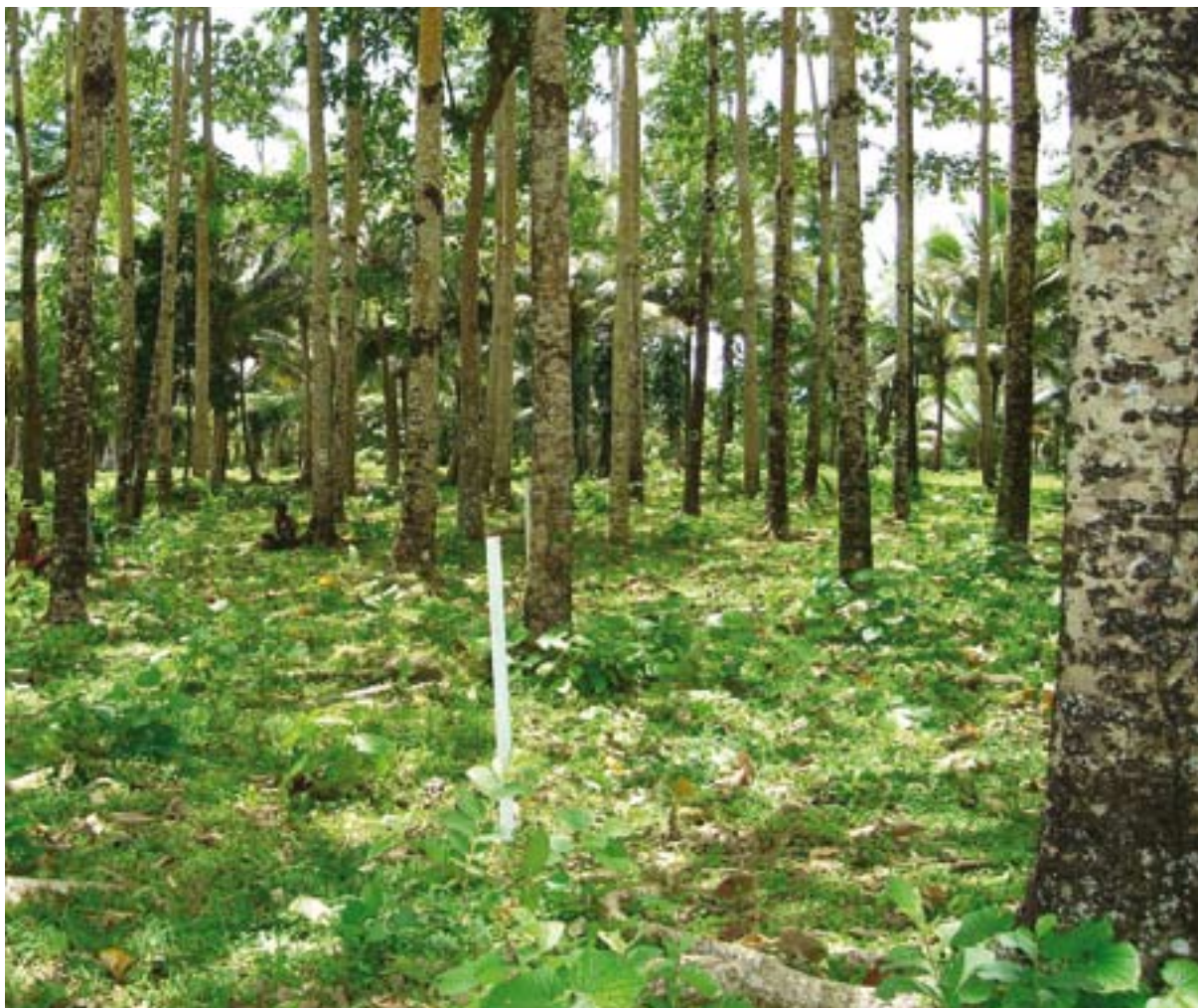
A Whitewood plantation in Vanuatu

Tuna is the main fishery export from Tonga and, together with snapper and aquarium fish, is a major export income source. Research will continue into the development of aquaculture systems for commercially important reef species (e.g. hatchery production of winged oyster).