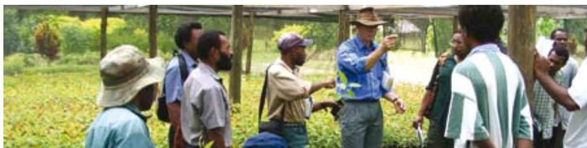
PNG Forest Research Institute staff discussing seedling development as part of a tree seedling nursery training course