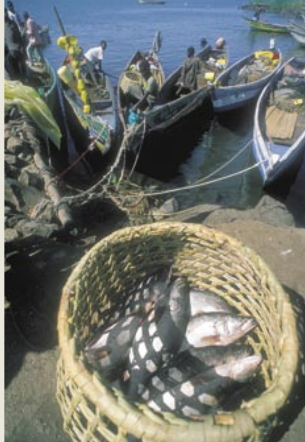
Surface tension: trash fish or cash fish.