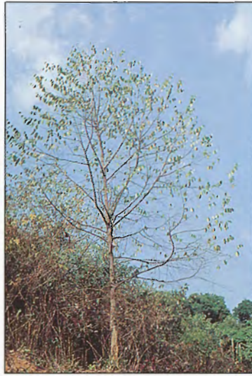
Plate 1. A five-year-old tree of Styrax tonkinensis at Ban Kajet, Louang Phabang, Laos