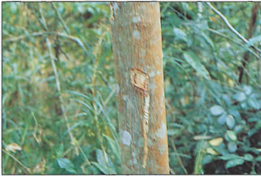
Plate 2. Resin flows from incision on a tree of Styrax tonkinensis