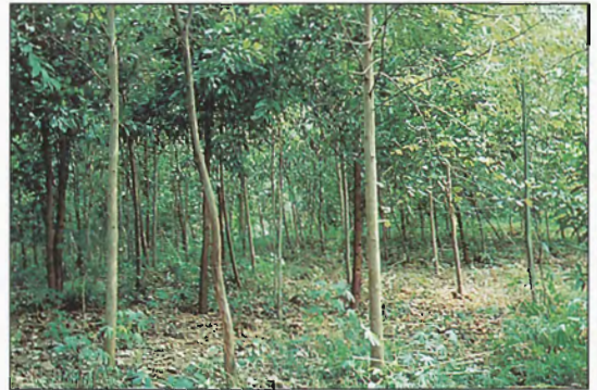
Plate 5. Styrax tonkinensis interplanted with Acacia mangium at Cau Hai, Vinh Phu, Vietnam. Growth of the two species is comparable at three years of age