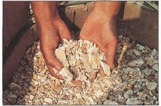
Plate 3. Benzoin resin of Styrax tonkinensis