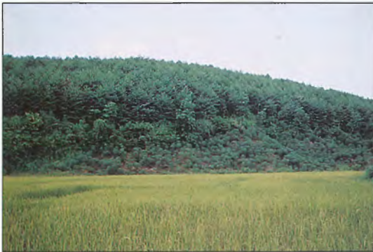
Plate 4. Two-year-old plantation of Styrax tonkinensis at Cau Hai, Vinh Phu, Vietnam