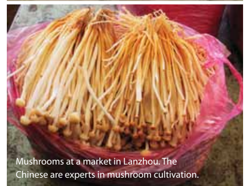
Mushrooms at a market in Lanzhou. The Chinese are experts in mushroom cultivation.