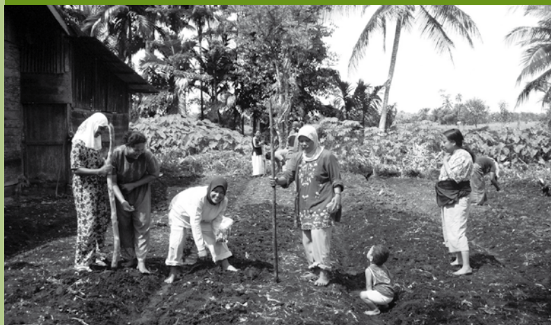
LEFT: Fruits of long term work to rebuild agricultural capacity in Aceh

Staffing levels (FTEs) at ACIAR did not increase in 2007–08. Outlays on salaries increased from $5.3 million in 2006–07 to $5.4 million in 2007–08.